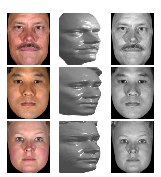
Figure 1. Albedo outputs from Texas database for 3 individuals. On each row, the images are in the order of the portrait, the shape and the recovered albedo map

Once s is calculated, \rho can be found using (1) easily. Examples of output albedo maps are shown in Fig. 1.