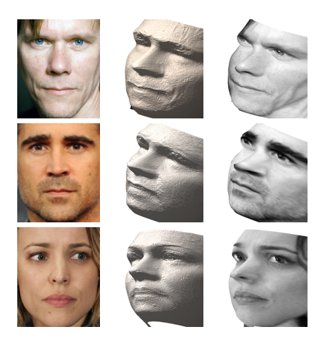
Figure 5. Three general examples of arbitrary individuals